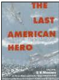
By G.B. Mooney